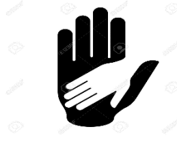
Figure 2: Text and culture Iser (1972)